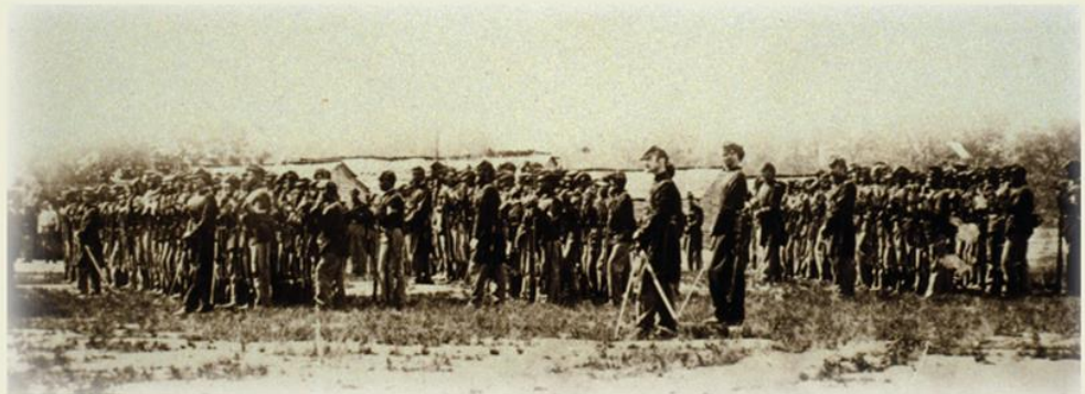
Below: The First Regiment of the U.S. Colored Infantry mustered at Mason's Island (now Theodore Roosevelt Island).