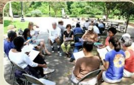
The Howard University archeology team surveys the park.