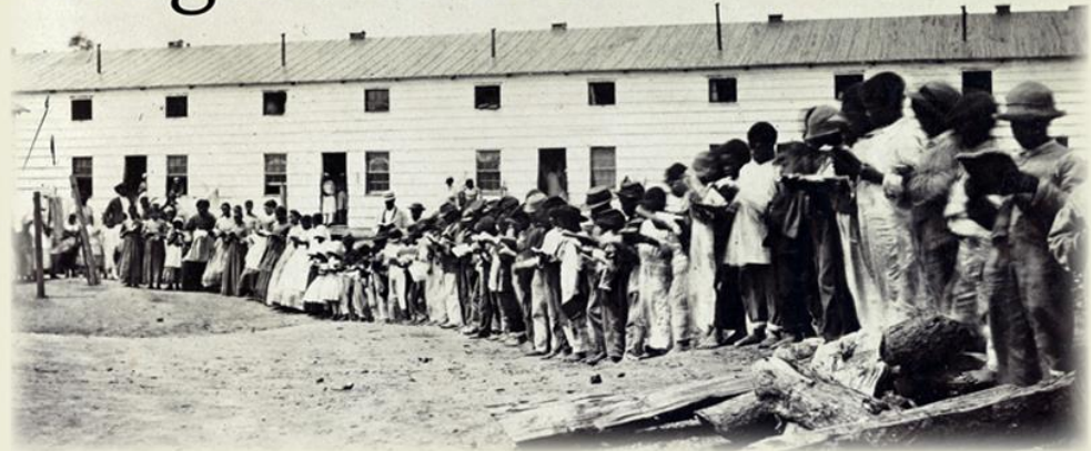
Above: Thousands of self-emancipated people stayed at Camp Barker at 12th and R streets, N.W.

Mt. Pleasant Plains Cemetery at Walter Pierce Park is a National Underground Railroad Network to Freedom site. These signs were erected by Rock Creek Park and the Kalorama Citizens Association with funding from the Association for the Study of African American Life and History and the National Underground Railroad Network to Freedom, National Park Service.