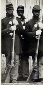
Fort Corcoran, Arlington, Va., 1865