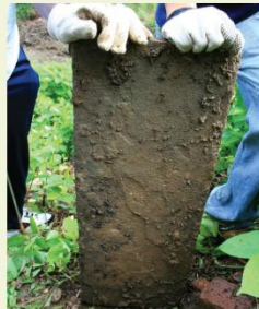
A HEADSTONE FROM THE CEMETERIES.

The 8,428 graves of the much larger African American cemetery spread across today's Walter Pierce Park, from Adams Mill Road down to Rock Creek and onto land now owned by the National Zoo. A cobblestone road wound through the burial ground.